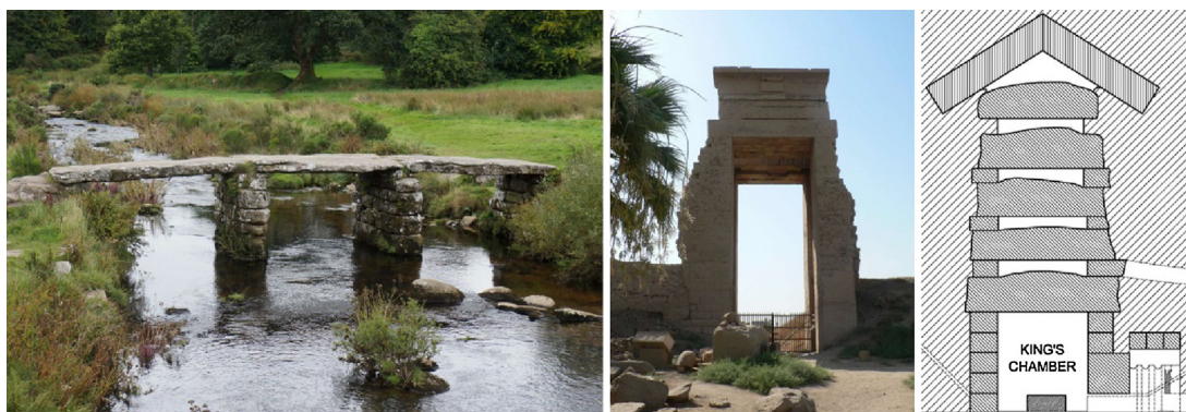
Fig. 1. Examples of stone beams from left to right: the clapper bridge at Postbridge (XIII century, span 3.75 m); the Nectanebos II gate at Karnak (the unsupported length of the beams is 7.2 m; note the relieving gaps between the beams); the relieving chambers inside the great pyramid of Cheops, where granite beams span 5.2 m.

unsupported length much higher of 7 m were realized in the ancient China.