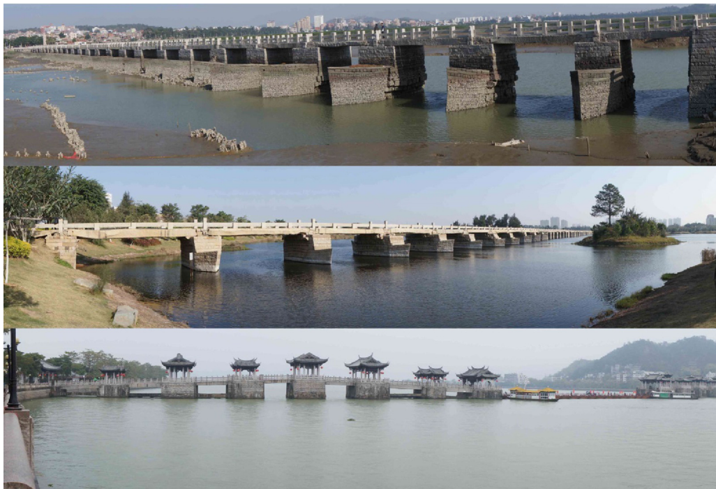
Fig. 2. Megalithic stone beam bridges: Luoyang (mid XII Century, number 4); Anping (mid XII Century, number 8); Guangji (end of XII Century, number 12).