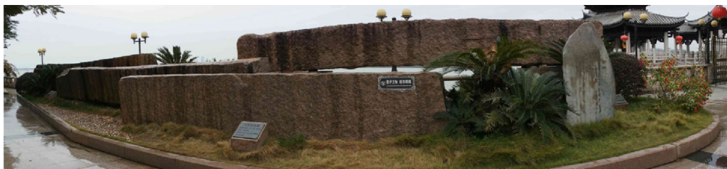
Fig. 4. Ancient granite stone beams of the Guangji bridge (number 12), preserved in a park near the bridge. The spans range between 10 and 14 m.

of the stone bridges behave as simply supported rods (note that Fugl-Mayer assumes that the ratio between the length of the beam and its depth is equal to 15, while a value 17.5 was measured for the Jiangdong bridge), the Navier equation bending (which does not take into account any size effect) predicts the maximum stress \sigma_{\max} to be given by: