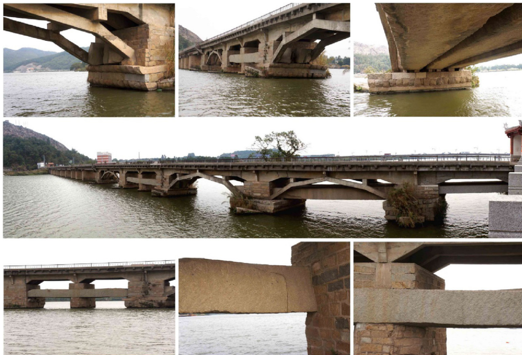
Fig. 3. The Jiangdong bridge (number 10, also called Po-Lam bridge, early XIII Century), with the greatest span in the world covered by a stone beam. Upper part, from left to right: two pieces of ruined beams (once spanning 18.60 m) still in place; three stone beams spanning 14.60 m are still in place; one end of the longest beam (a crack is visible near the supporting masonry). Central part: a general view of the bridge. Lower part, from left to right: a view of the longest span stone beam, with the added central support; a view of a detail of the bridge; the central support added at midspan of the longest stone beam ever realized in the world.